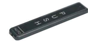
Wired push button