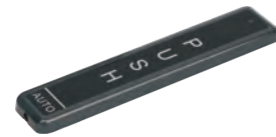
Wired push button